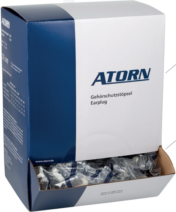
Ref. no. 000