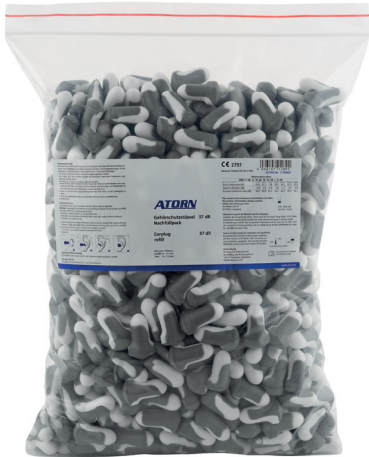
Ref. no. 001