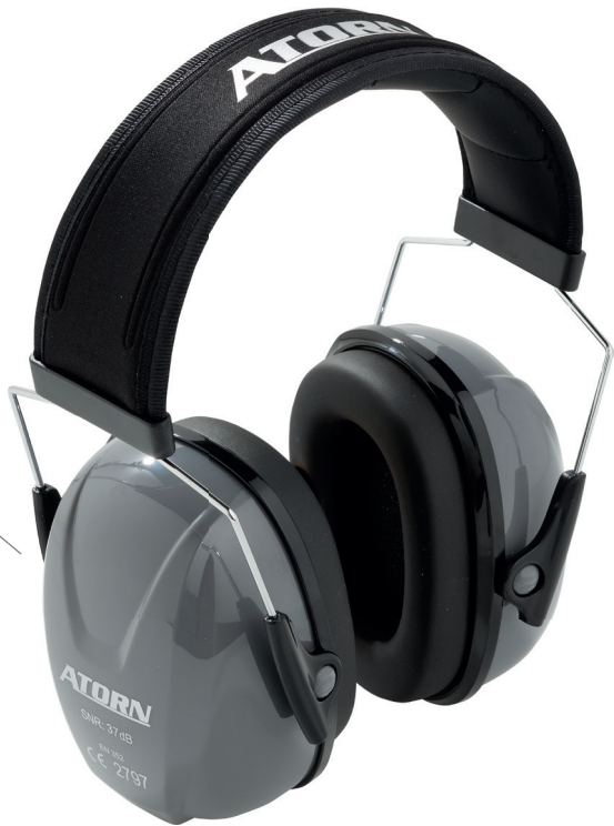
Ref. no. 007

SNR value: SNR = 33 dB, H = 35 dB, M = 31 dB, L = 24 dB